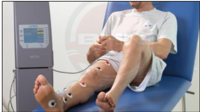
Figure 1: FREMS/TENS machine used in FREMS-PDPN

TENS is used quite commonly in the NHS for pain relief in various conditions such as arthritis and endometriosis. In this study we will be giving TENS treatment using an APTIVA® device. It works with 8 electrode pads that stick to the skin on the feet and legs. These deliver electrical pulses with a fixed frequency to stimulate nerve ends just under the skin in the affected area. This can potentially reduce the transmission of pain signals to the brain and spinal cord.